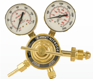
HIGH PRESSURE NITROGEN REGULATOR