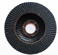
FLAP DISK SS