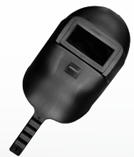
WELDING HAND SHIELD PLASTIC