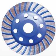
DIAMOND GRINDING WHEEL