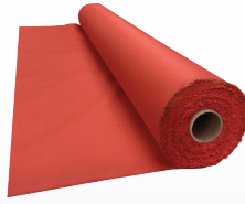
ACRYLIC COATED FIRE BLANKET