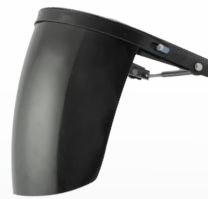
FIBER METAL WELDING HELMET