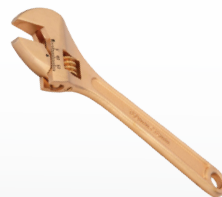
NON SPARKING ADJUSTABLE WRENCH