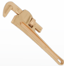
NON SPARKING PIPE WRENCH