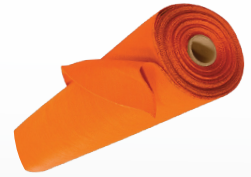
PVC COATED FIBRE GLASS FIRE BLANKET