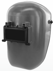
FIBER METAL WELDING HELMET WITH HARD HAT