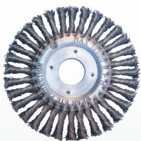
TWIST KNOT WHEEL SS/CS