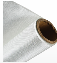
FIBRE GLASS FIRE BLANKET