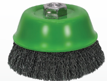
CRIMPED CUP BRUSH CS/SS