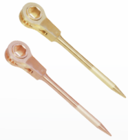
NON SPARKING RACHET WRENCH