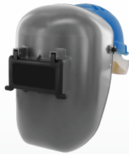
FIBER METAL WELDING HELMET