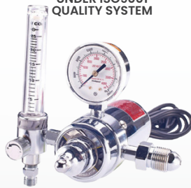
ELECTRICALLY HEATED CO2 REGULATOR