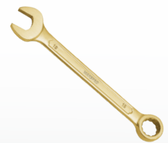
NON SPARKING COMBINATION SPANNER