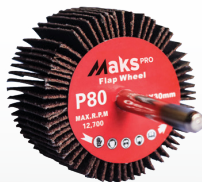
FLAP WHEEL SS