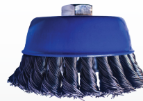
TWISTED CUP BRUSH CS/SS