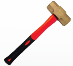
NON SPARKING SLEDGE HAMMER