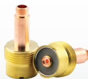
GAS LENS COLLECT