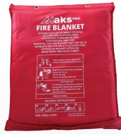
FIRE BLANKET IN SOFT BAG